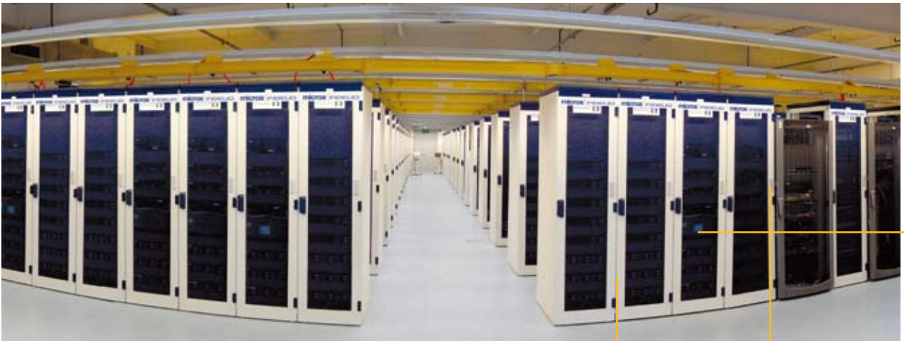
MICROS-Fidelio data centre, Frankfurt, Germany

As a leading provider of hosted solutions for the hospitality and retail industries, MICROS-Fidelio has built one of the largest and most innovative data centre networks in Frankfurt, Germany. The data centre is a joint technology venture between MICROS-Fidelio and the hardware vendor HP – both recognised, leading players in their industries. Today we host over 58 customers, 45 hotel chains, 2,100 property management systems, 2,500 central reservation systems and over 2,500 restaurants.